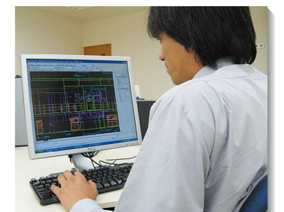
Design work using a CAD system