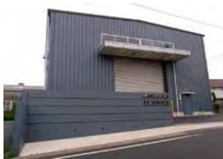
Mizuki Factory (Assembly Plant)