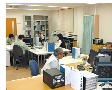
Reliable organization with design department