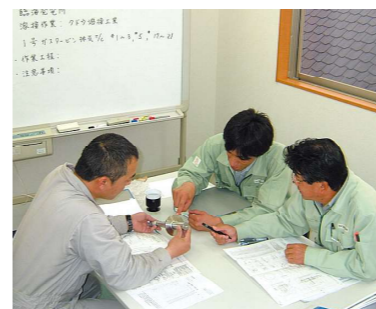
Procurement of the materials best suitable for your needs