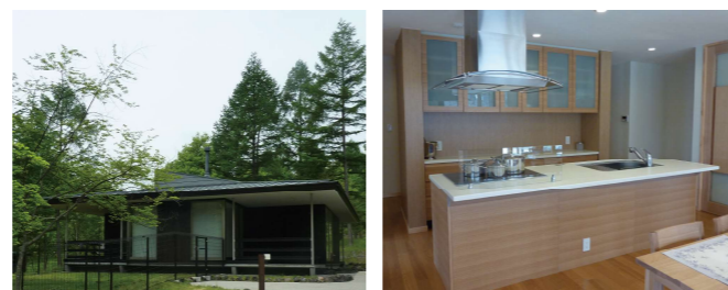
Karuizawa 「Asama terrace」

Hitachi Musen Denki actively addresses the enrichment of off time as well as the creation of a pleasant working environment. We use facilities of Karuizawa as a place of the communication. Our employee can use the facilities freely anytime.